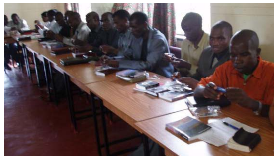
Pastors Receiving MP3 Training

the seven Zambian languages as well as many other oral training resources.