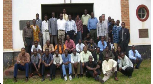
Zambian Church Leadership Conference

A team from MAF Learning Technologies took part in hosting a major conference for 42 pastors and church leaders in Zambia. In this conference, pastors learned Oneness in Christ from Romans, Simply the Story (STS) oral Bible teaching, and how to use MP3 players for digital resource training. Each pastor received a 1GB MP3 player and a nice digital library of God's Story in