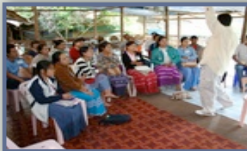
Telling a story

A teammate of mine traveled to a remote and undisclosed location to teach a class on Simply The Story (STS). Simply The Story is a process of story-telling and group discussions that are focused on Bible stories. The techniques that are learned provide a means of exploring biblical truths in an oral style.