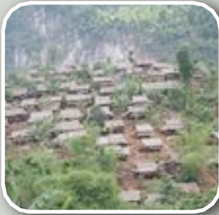
A refugee camp

Around the world there are many people groups that have been dislodged from their