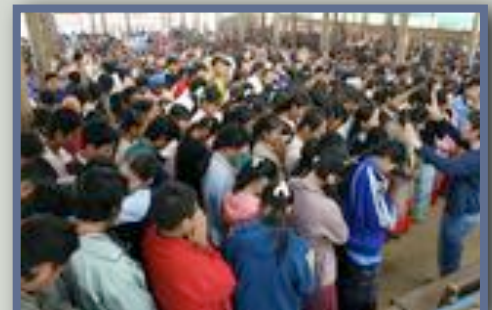
A worship service in the camp

One student who had traveled to a war-torn area of their country reported that, after using the STS techniques, nearly two dozen adults received Christ and so many children acknowledged Jesus that they have to return to that area for more discipleship.